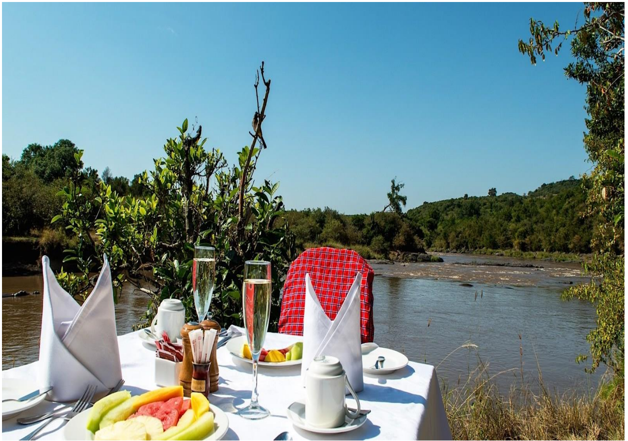
END OF SAFARI